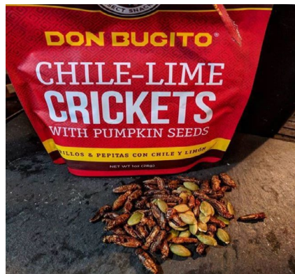
(6) Crickets: Insect protein snack