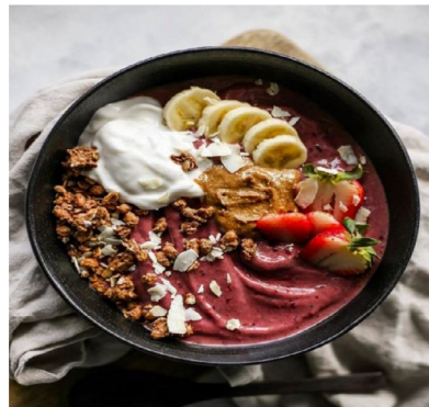
(4) Smoothie bowl with insect powder