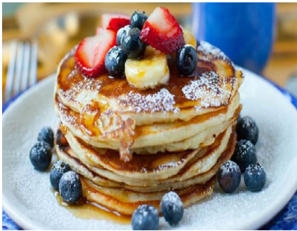
(1) Pancakes with insect powder

Food neophobia was assessed based on a statement in which respondents chose the one that best suited them from among three options: "I often try new foods and am curious about new products"; "I am open to new foods, but it should be close to what I already know"; and "I am not interested in eating foods that I do not know, especially if they contain ingredients that I have never eaten before."