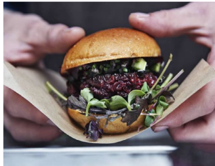
(2) Burger with insects