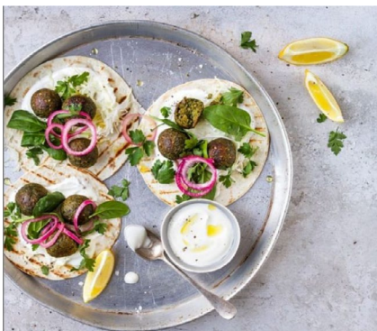
(3) Insect lime-and-thyme balls