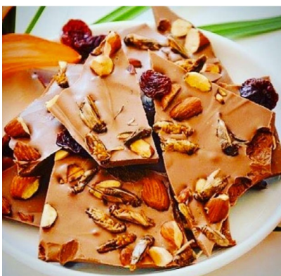
(5) Insects covered in chocolate